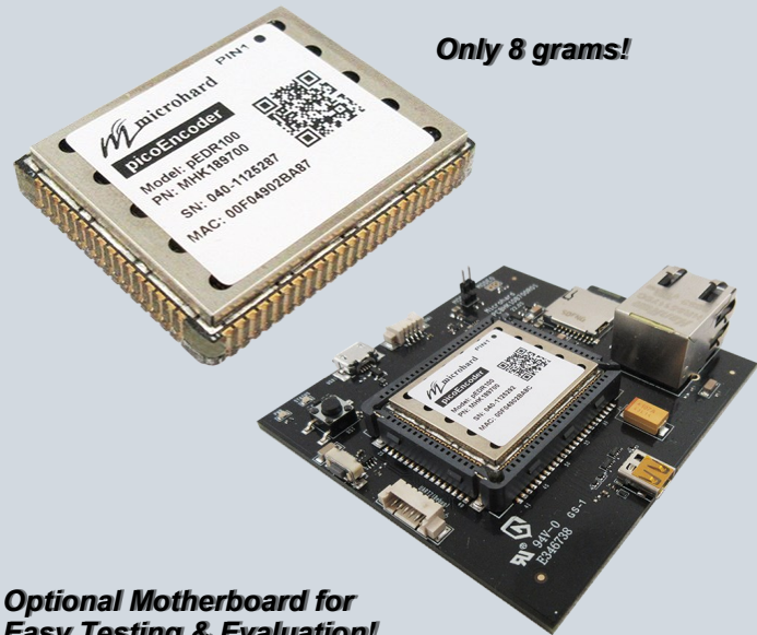
Optional Motherboard for Easy Testing & Evaluation!